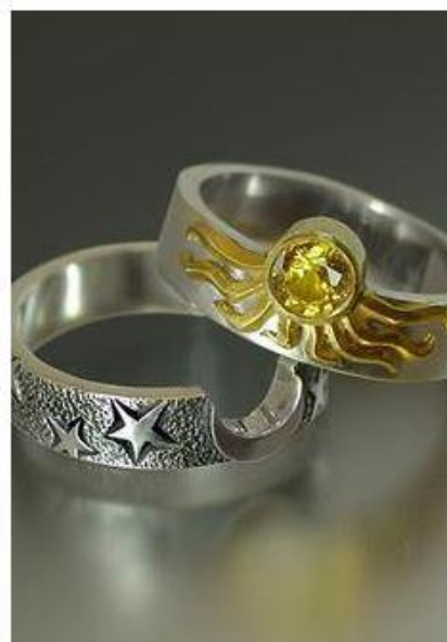
Sun and Moon ring $200.00