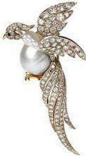
Diamond Bird pin $250.00