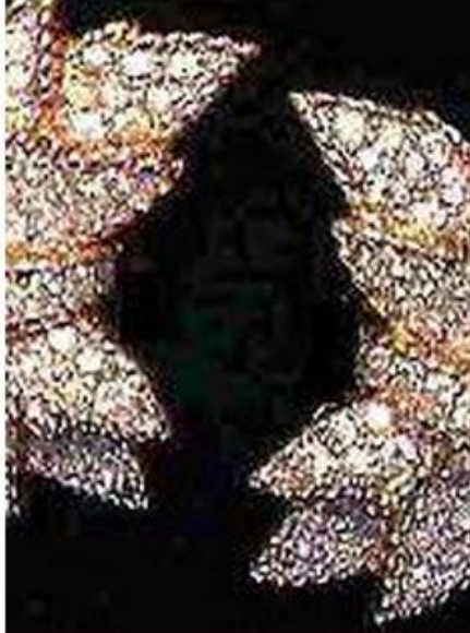
Gold and Diamonds $1,000.00