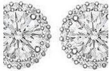
Diamond Studs $1,500.00