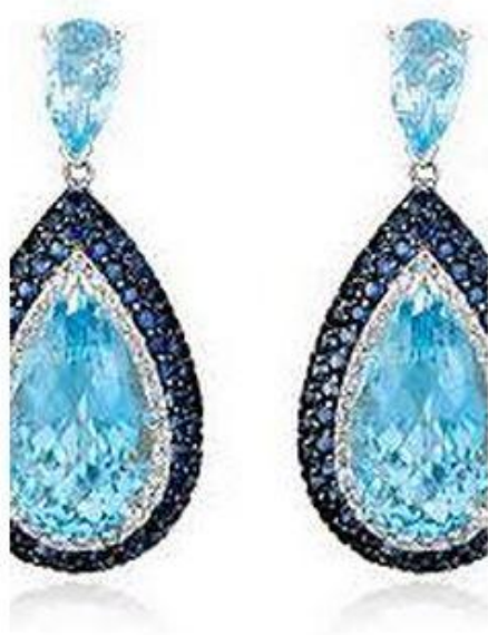
TOPAZ Ear-ring $750.00