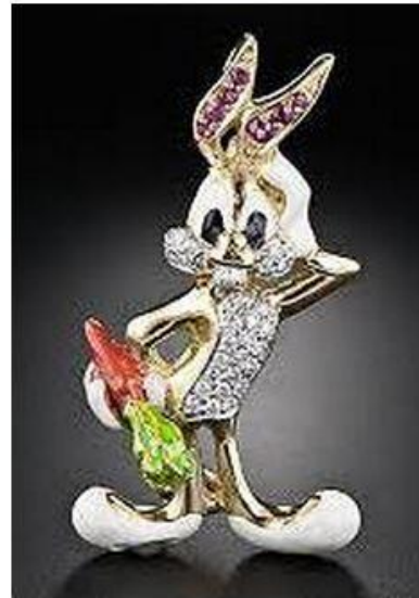
Bunny Pin $100.00