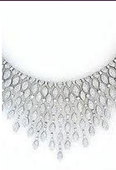
Diamond Necklace $25,000.00