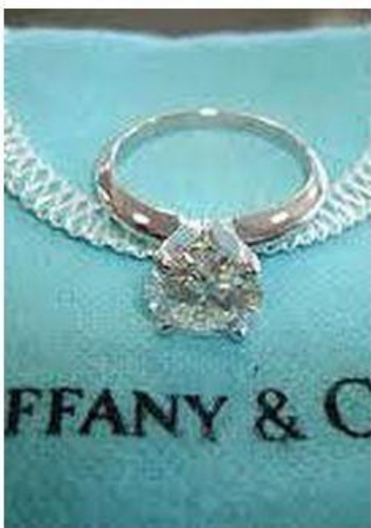
Tiffany & Co. ring $25,000.00