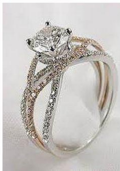
Diamond wedding Ring $10,000.00