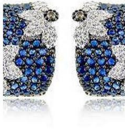
Blue Diamonds $500.00